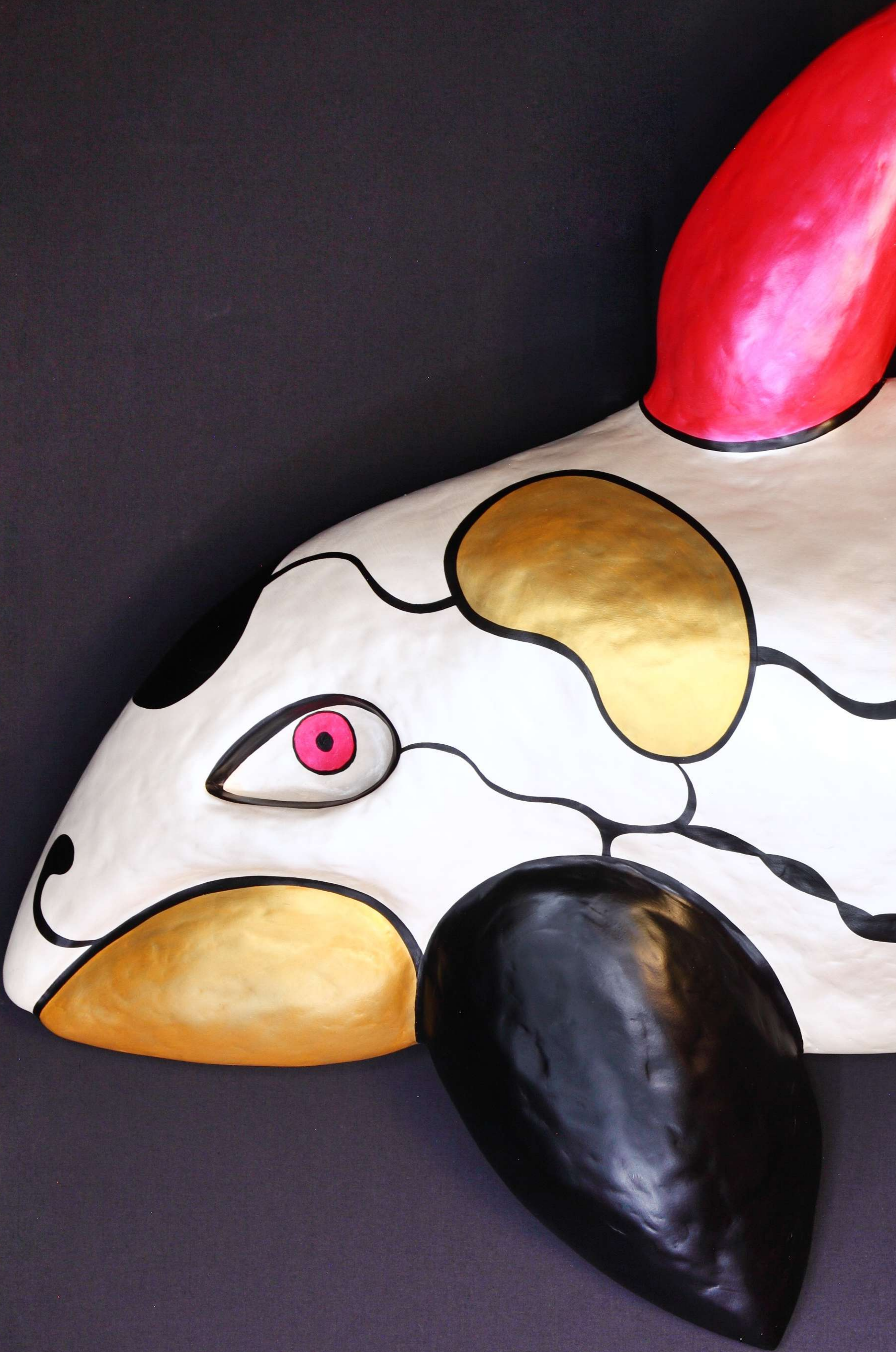
Niki de Saint Phalle, Shamu - You Are My Killer Whale , 1997