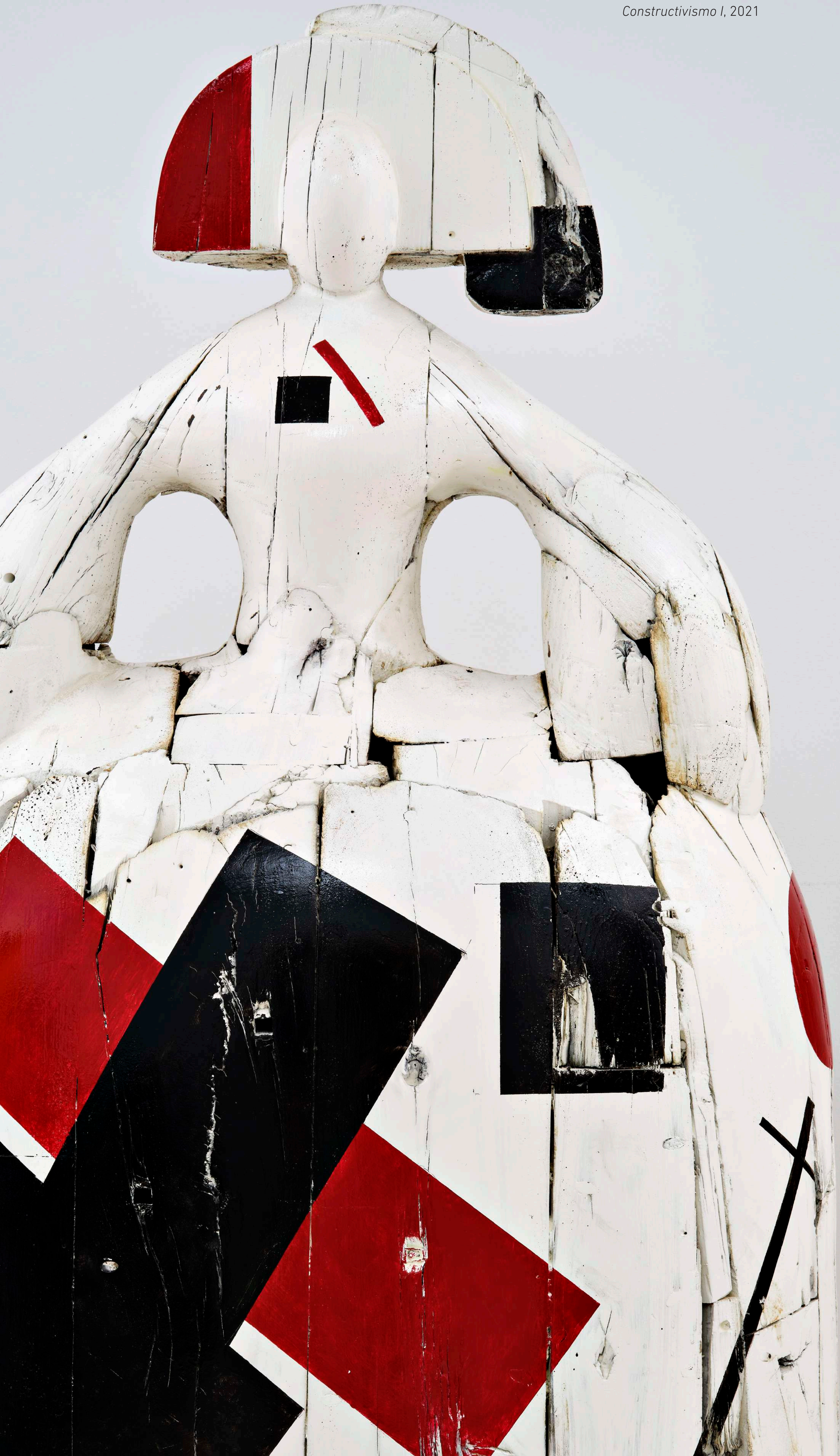
Manolo Valdés, Reina Mariana Constructivismo I , 2021